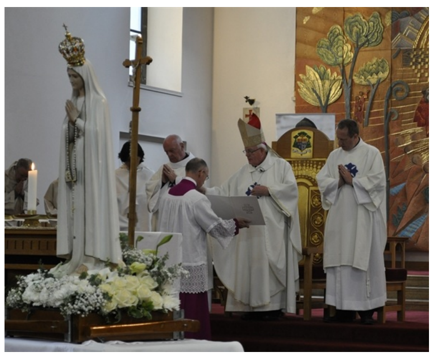
WAF England and Wales Newsletter, First Saturdays, November 2017